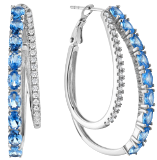
Azure Sterling Silver, Blue Spinel & DiAmi. Omega post earrings | TE80605 $149